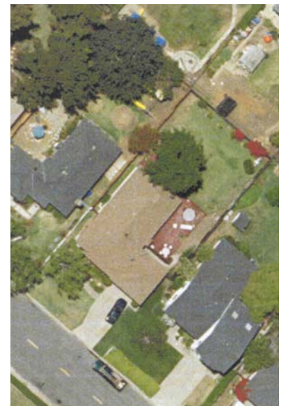
Sample aerial image of Santa Ana Heights

For this study, we chose to use ArcView along with the aerial photographs of the Santa Ana Heights community. Lot size data was obtained from the county assessor and confirmed using ArcView. The cost for the photography and setup in ArcView was around $24,000. Resolution was approximately 6” per pixel. ArcView allowed us to trace polygons around the hardscape of each property and subtract the hardscape area from the total lot size to calculate the irrigatable area, or landscape area. It takes about one minute to measure the total lot size and the hardscape. Using this method of measurement, the only question in accuracy is in identifying landscape or hardscape that is hidden underneath any sort of canopy.